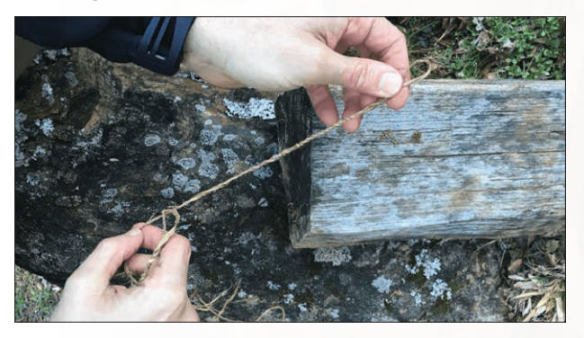
Foraging Masterclass £80 pp